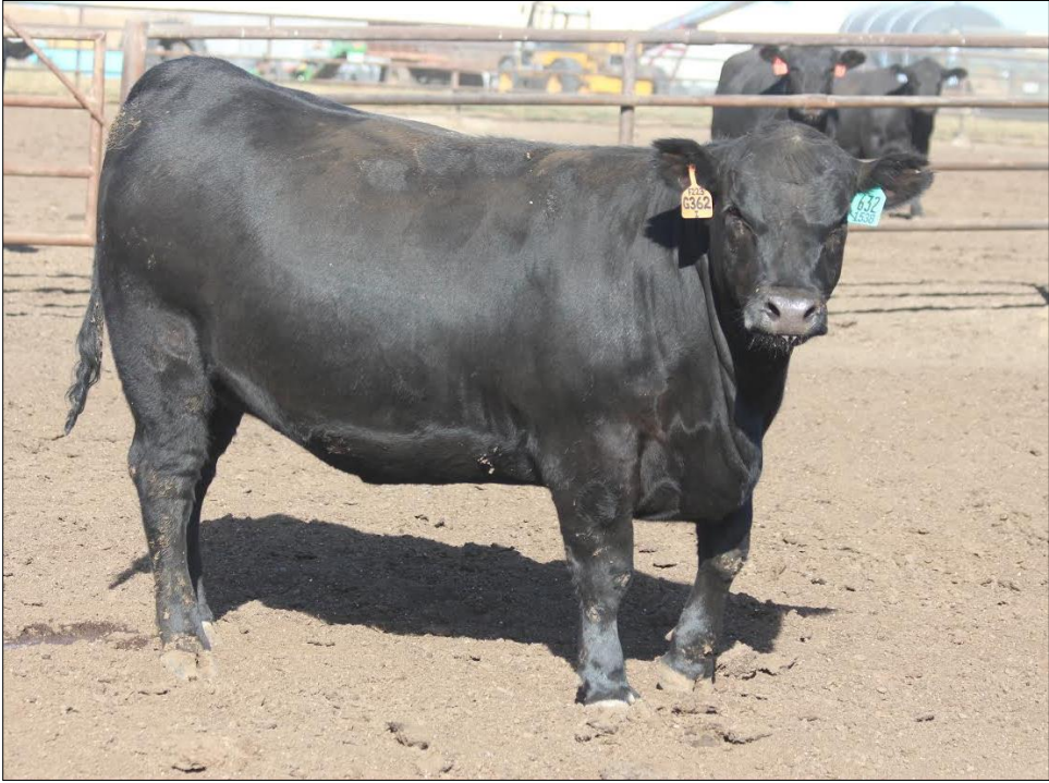
Low $B Heifer---graded Low Choice YG2 with an 870-lb. carcass.